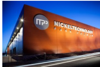
BCC's head office is located in Nickel Technology Park which has recently joined the International Association of Science Parks alongside Technopark Gliwice.

determined by local conditions and needs."